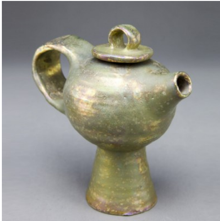
Beatrice Wood, Teapot, from the Clark Collection